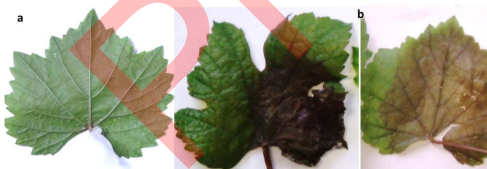
Figure: (3). The pathogenicity of B. cinerea on fresh grape leaves. [a: Leaves not injected with fungus b: Leaves injected with fungus.]