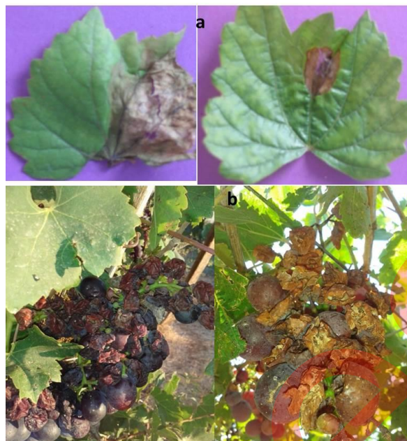
Figure: (1). The symptoms of gray mold disease on the leaves and grape fruit.

on the infected fruits. These symptoms align with the findings of Wilcox (2005), Jayawardena et al. (2018), and Zhou et al. (2014), who also identified Botrytis cinerea as the cause of this disease in grapevines.